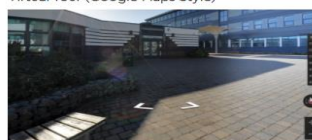
Virtual Tour (Google Maps Style)

This tour allows you to select the rooms and blocks to have a self-guided "Google Map" style tour around the school.