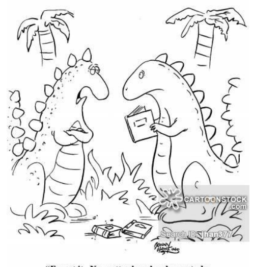
"Forget it. No matter how hard you study, you'll never become a thesaurus."